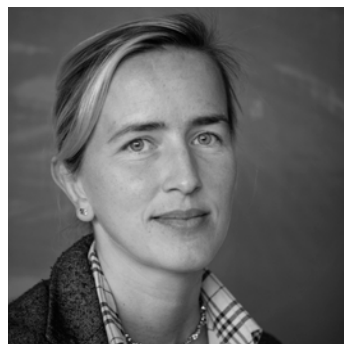
PROF. SANDRA VAN VLIERBERGHE Polymer Chemistry and Biomaterials Group (PBM)

The key objectives of the Polymer Chemistry Research Group (PCR) can be described under the general heading “design, characterization and application of tailor-made, functional polymer structures and polymeric-derived materials”.